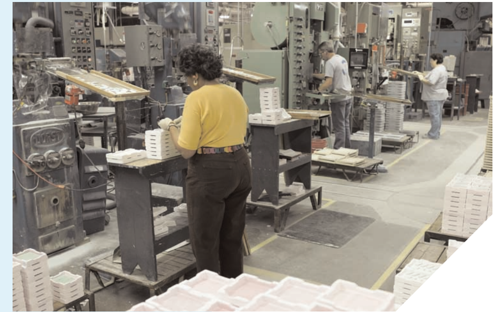
Dry pressing of high volume ceramic insulators.

Typical ceramic forming technologies used for the production of the ceramic insulators used within our Hermetic products include