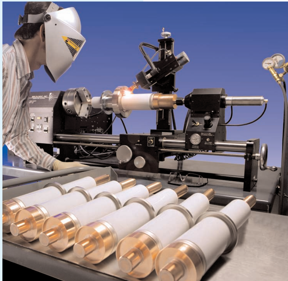
Welding of Ceramaseal® products using an automatic T.I.G. welding lathe

Many of CeramTec's standard and custom Ceramaseal® products require the welding of the feedthroughs into flanges or plates. We are equipped with both automatic and manual pulsed T.I.G. welding stations. For precision welding applications that require a lower welding temperature to protect the seal joint, we utilize laser welding technology. Induction brazing equipment is also used.