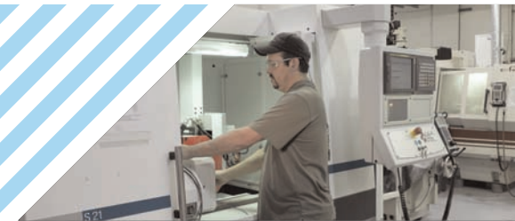
Hard (diamond) grinding of ceramic products to achieve tight tolerances.

extrusion, dry pressing and isostatic pressing. High volume insulators are usually dry pressed, while tube or rod-like insulators are extruded and large or complex insulators are isostatically pressed. Many of these insulators will go through our "green" (compressed powder, before firing) machining process before being fired. Green machining can typically achieve tolerances of +/- 1% or +/- .005", whichever is greater.