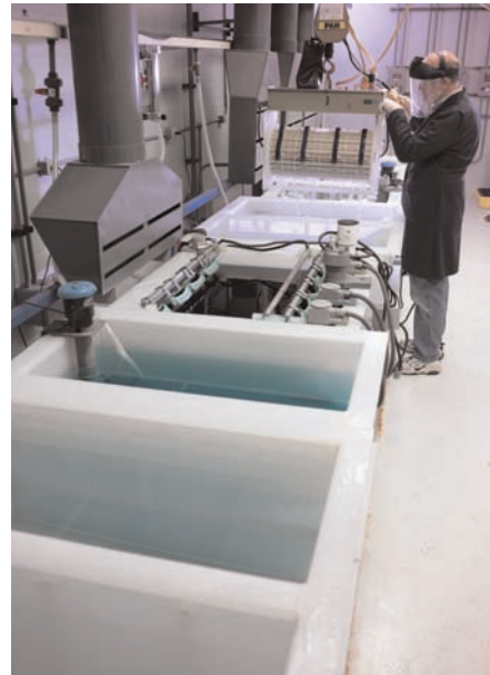
Electrolytic nickel plating of metallized ceramic insulators and other metal components.

Metallized ceramic insulators that will be used in our moly-manganese sealing process have to be nickel plated first. CeramTec has both electroless and electrolytic nickel plating lines, which are used for plating over the molybdenum metallizing on the insulators as well as other metal components. A separate gold plating line is primarily used to gold plate the pins and female contacts on finished connector assemblies to maximize the electrical contact.