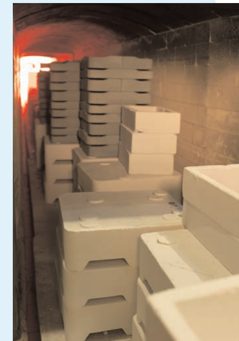
Continuous tunnel kiln used to fire ceramic insulators.

The firing or sintering process is the prolonged baking of the ceramic parts in a gas or electric kiln at temperatures between 1,300 – 1,800° C (based on the specific material being sintered). Through reactions that occur during sintering, a strengthening and densification of the ceramic takes place, resulting in a reduction in porosity. There is approximately 20% controlled shrinkage when firing ceramics. Typical firing cycles can range from 12 - 120 hours depending upon the kiln type and product.