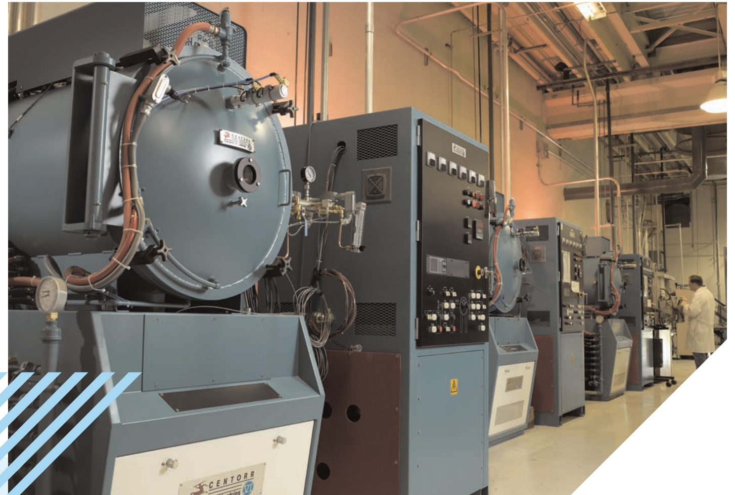
Vacuum brazing furnaces with computer programmed profiles.