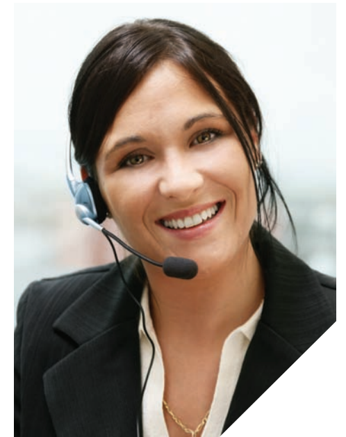
Customer service representatives standing by to serve you.

Throughout all of our processes there are rigorous quality standards that are met and thorough inspections of incoming parts, in-process parts and final assemblies. CeramTec North America is ISO 9001:2000 quality system registered. Exceeding the customers' expectations is about more than shipping a quality product on time. It is about a higher level of customer service and support than is required, which is what our sales and customer service staff aim to accomplish throughout the sales process.