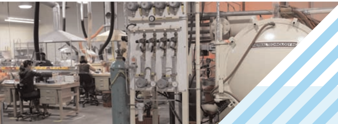
Thick film metallization of ceramic insulators.