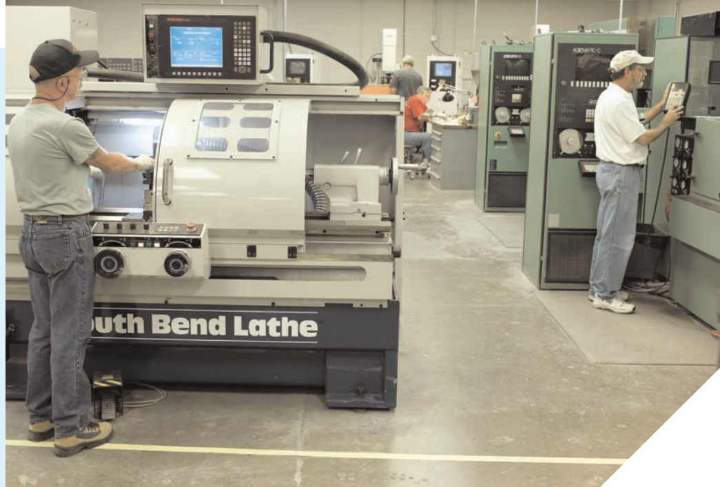
Machining of metal components for Ceramaseal® assemblies using a CNC lathe.

Machining of complex metal components is all done within our in-house machine shop. We utilize multiple EDM and wire EDM machines, CNC and mechanical lathes, milling machines and other metal machining equipment to precision machine the components used within our assemblies. We also machine our own firing fixtures and the dies used within our pressing equipment.